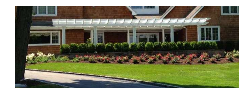
Affordable. Elegance. Lasting Beauty. The world's first complete fiberglass pergola system

The strongest pergola kit on the market does not absorb moisture allowing paint to adhere much longer. Incredible strength sets this pergola apart. Without metal or wood inserts, you can have a freestanding pergola with an overall size of 18' x 18' with just four columns!